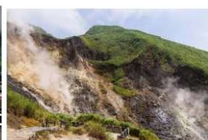
Xiao you keng (Volcanic Area)