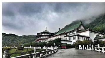
Zhongshan Building (Old Bundestag)