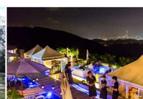
Dinner (Restaurant TBD)