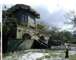
Yang Ming Studio