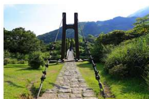
Leng shui keng