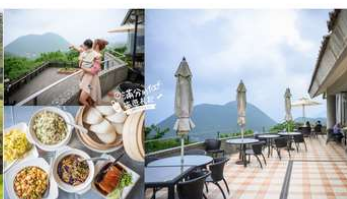
Jingshan Recreation Area (Lunch)