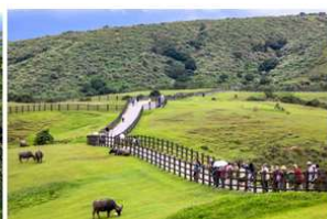
Qing tian gang